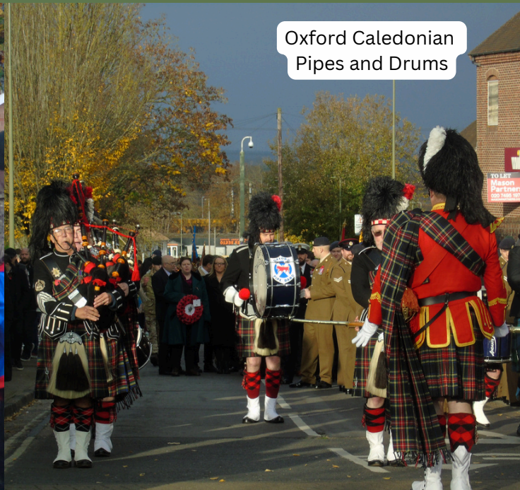
Oxford Caledonian Pipes and Drums