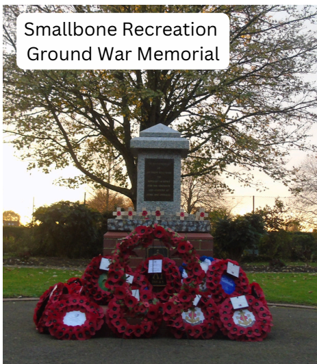
Smallbone Recreation Ground War Memorial

Remembrance Day is observed on 11th November to recall the end of First World War hostilities. Hostilities ended "at the 11th hour of the 11th day of the 11th month" of 1918, in accordance with the armistice signed by representatives of Germany and the Entente between 5:12 and 5:20 that morning. ("At the 11th hour" refers to the passing of the 11th hour, or 11:00 am.) The First World War formally ended with the signing of the Treaty of Versailles on 28 June 1919.