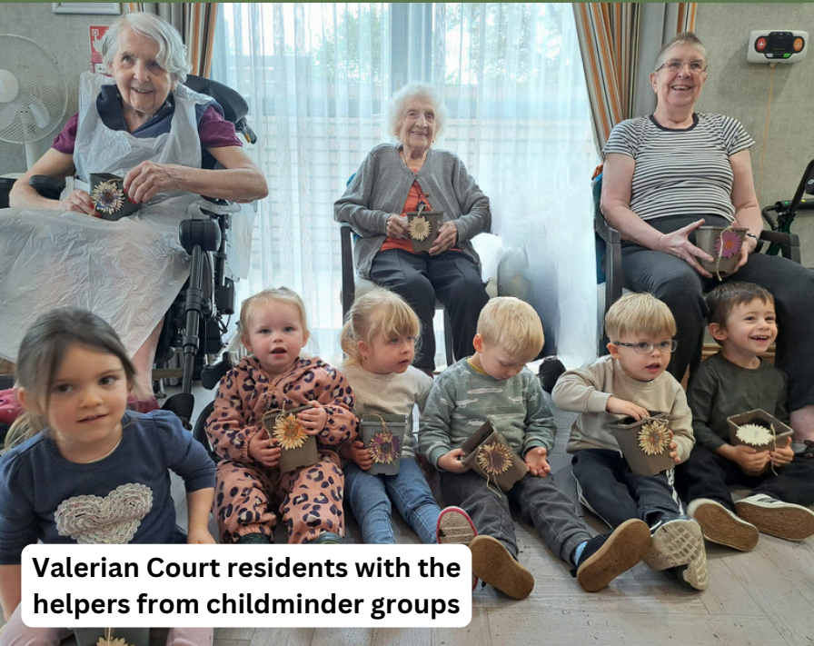
Valerian Court residents with the helpers from childminder groups