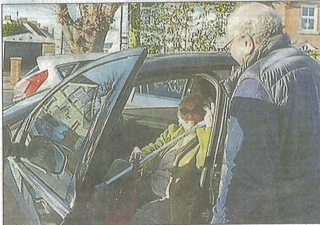
Didcot Volunteer Drivers with a client